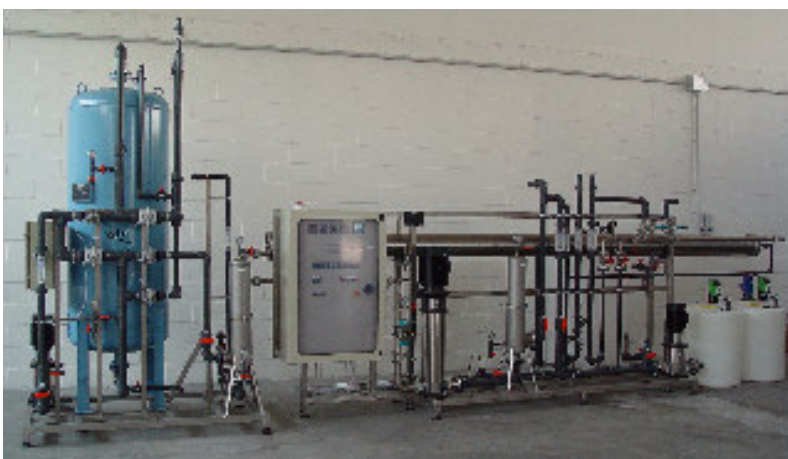
Example of a reverse osmosis system complete with pre-treatment: bi-layer filtration, dosing of chemical agents.

Before the reverse osmosis section, it is important to determine the most suitable "pre-treatment" based on the characteristics of the water to be treated in order to guarantee the greater operating continuity of the system and reduce washing frequency. A correct pre-treatment prevents relatively rapid lodgement of the membrane due to grime and/or physical impurities, lodgement due to precipitation of encrusting salts and/or metals, bacterial proliferation, contact with oxidising agents.